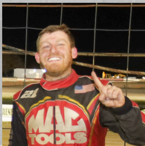
Cameron Meyer Sport Mods