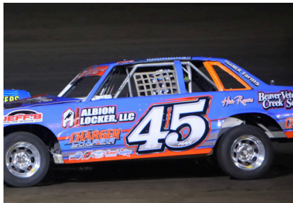
Travis Landauer #45