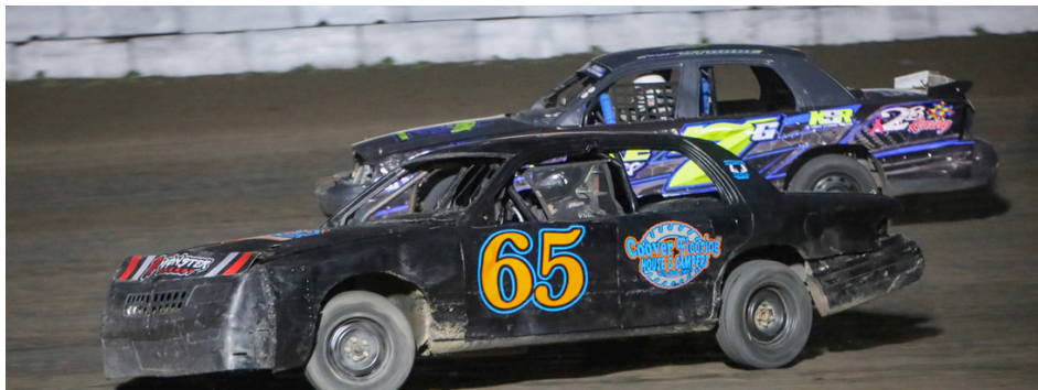
Tucker Knust #65, Grayson Stobbe #7G