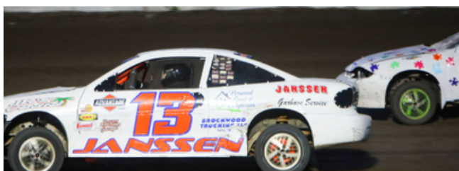
Braden Janssen #13