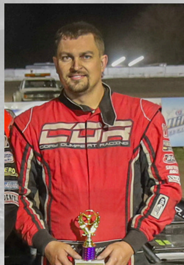
Cory Dumpert Late Models