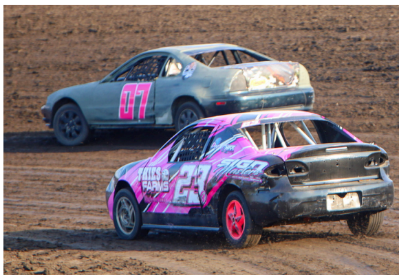
Brenden Fleming #07, Alyssa Thies #23A