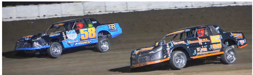
Kyle Wilkinson #58, Cameron Wilkinson #5