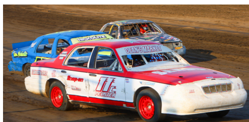
Camryn Pelster #11C,