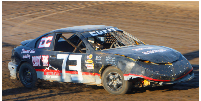
Dylan Curr #73