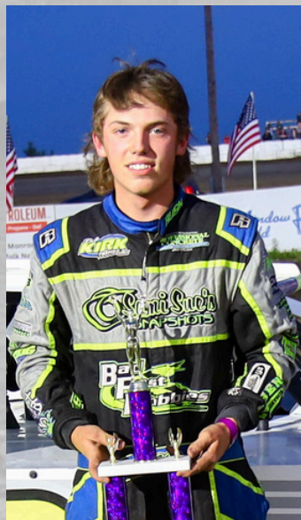
Willy Kirk Sport Mods