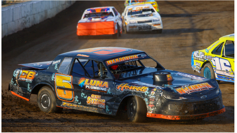
Cameron Wilkinson #5