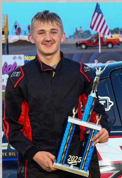
Bently Freeman Pro Stock 4