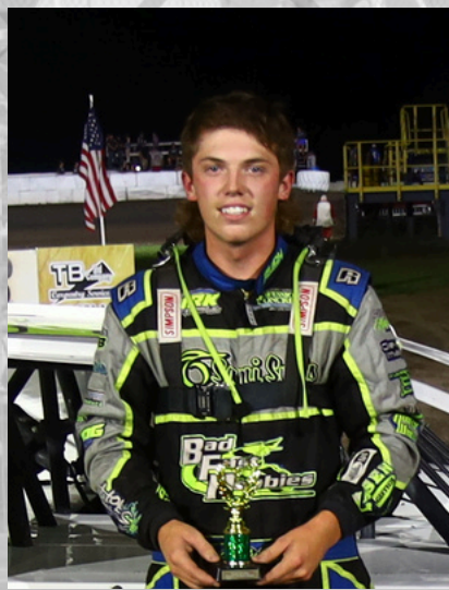
Willy Kirk Sport Mods