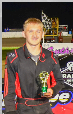
Bently Freeman Pro Stock 4