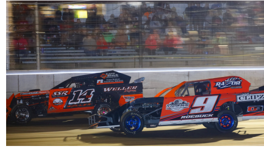
Brayden Weller #14, Landyn Roebuck #9