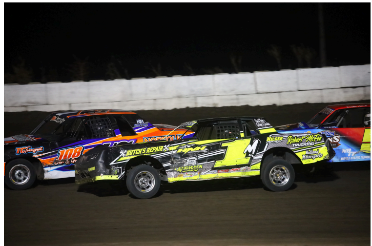
Cody Malasek #1M