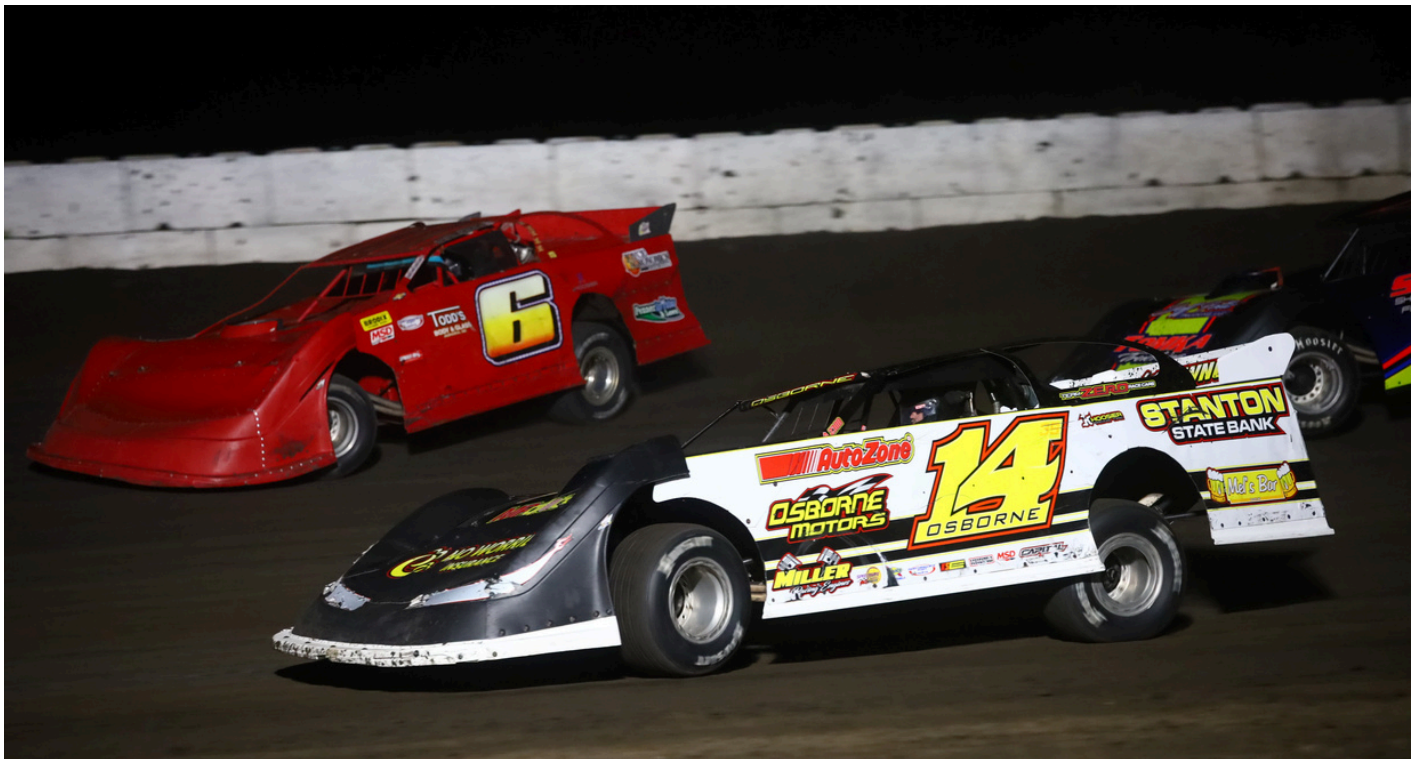
Landen Rojewski #6, Chase Osborne #14