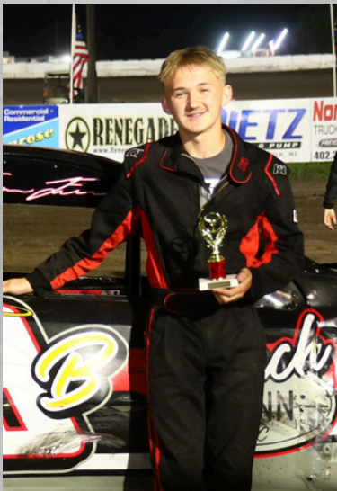
Bentley Freeman Pro Stock 4