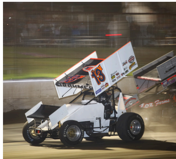
Seth Brahmer #13V