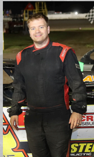
Chase Osborne Late Models