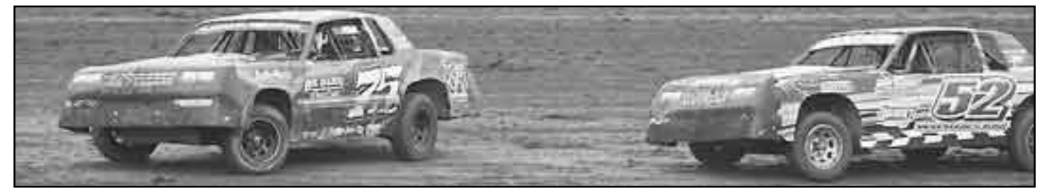
Cory Probst (75C) leads Cameron Wilkinson (52) in their heat race. The two locked horns later in the feature with Probst taking the feature victory. Wilkinson was second.