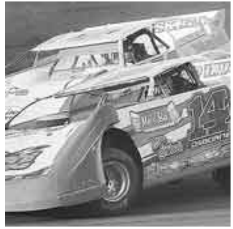
Chase Osborne (14) races Brian Kosiski (52) in their heat race. Osborne had the fourth quickest qualifying time, the quickest Off Road Speedway regular.