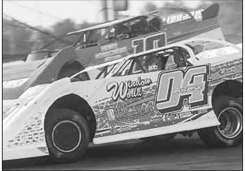
Tad Pospisil (04) races with Corey Zeitner (19) in their heat race. Pospisil led 15 laps in the feature and finished sixth.