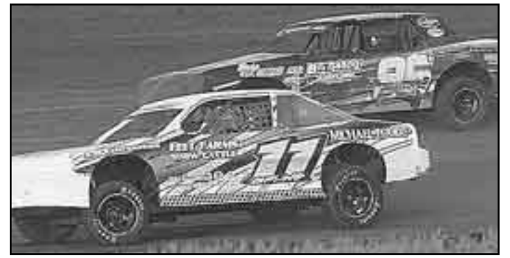
Chad Bruns (11) races with Dale Bittner (95D) in their heat race. Bruns won the heat race and later finished eight in the feature.