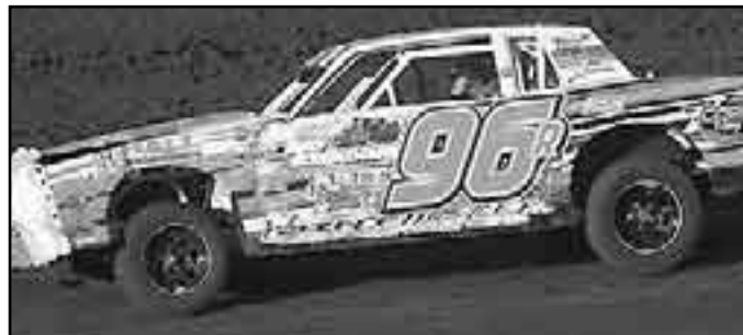
Stephanie Reynolds (96R) led four laps in for the two features and finished fourth in the first of two features.