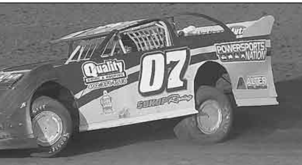
o features last week. He finished third in the second feature.