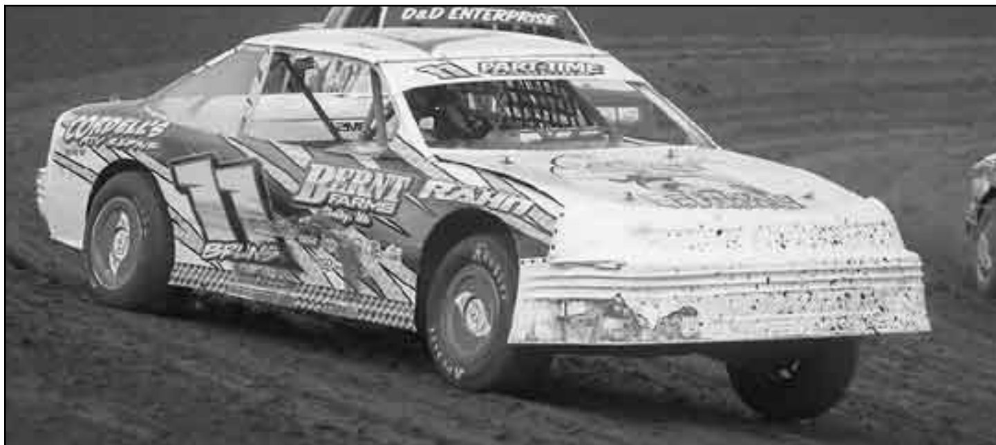
Chad Bruns (11) won both features last week, leading 23 of 33 laps raced.