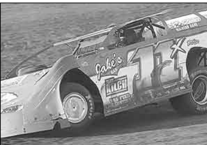
Nelson Vollbrecht (11x) finished second in the first feature after leading 17 laps.