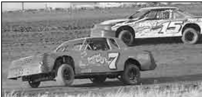
Steven Sanderford (7) took fourth in the first feature after leading two laps.