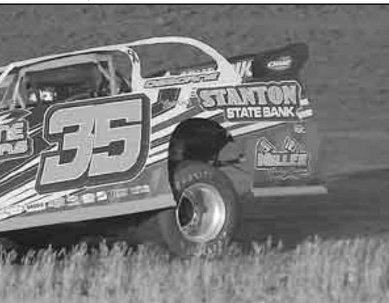
st win of the season.