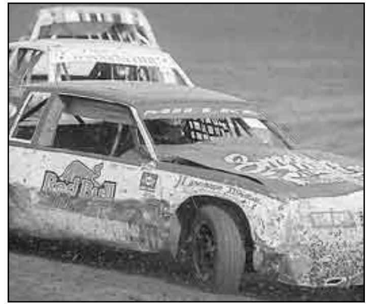
Lance Mielke (7) finished third in the feature.