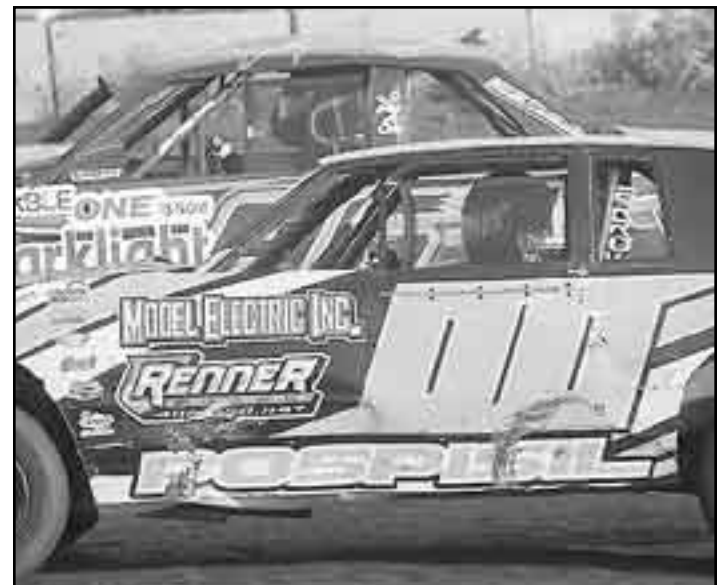
Shannon Pospisil finished fifth in the feature.