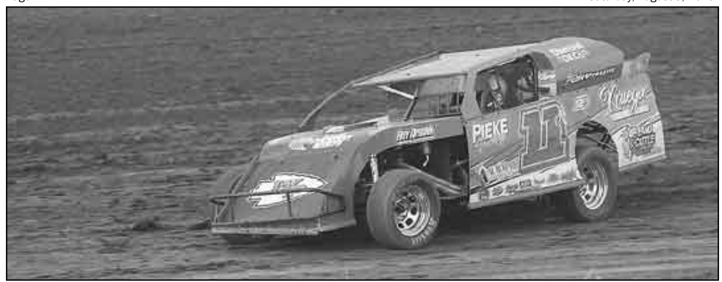
Tyler Afrank (11A) led 17 laps to pick up his first feature win at the track.