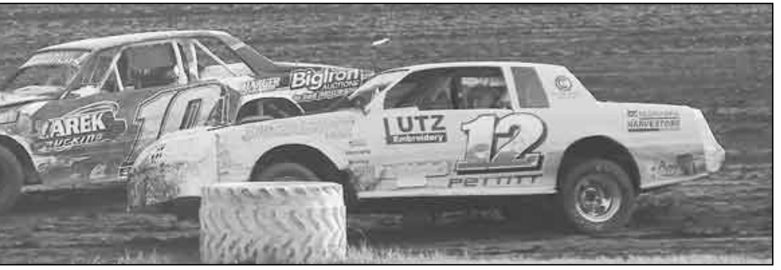
race in their heat race. Brauner finished third in the feature.