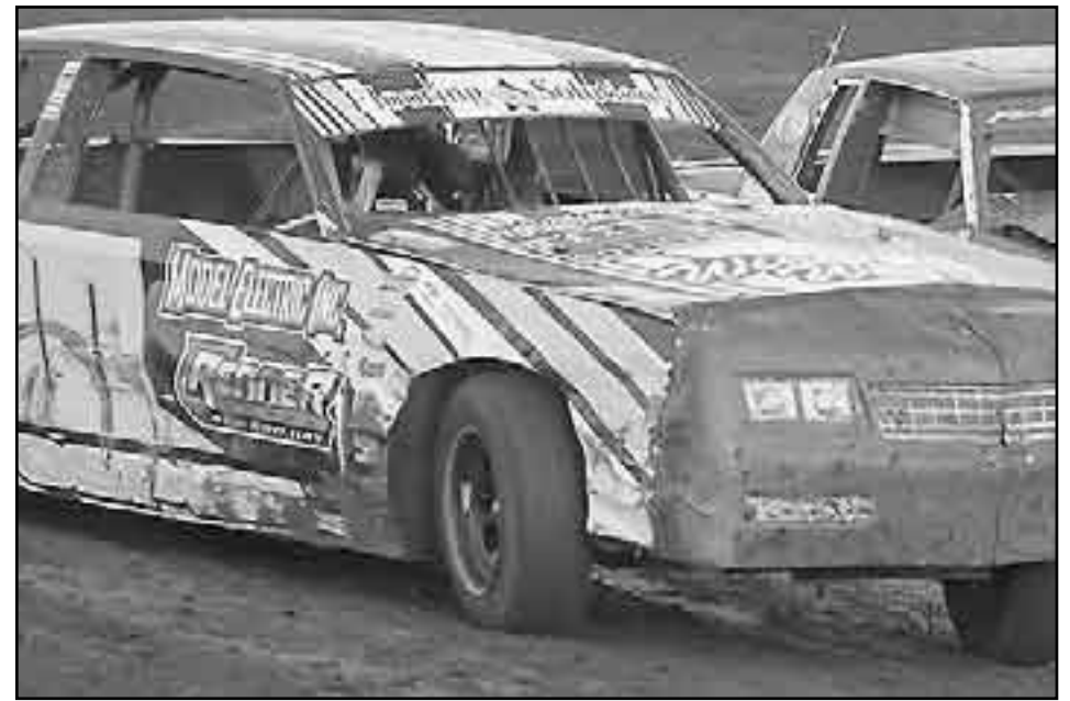
Saturday, August 24, 2019