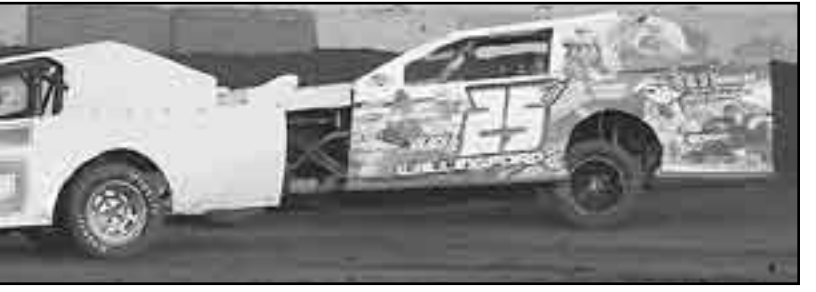
(25t) during their heat race. Haddix led nine laps in the feature

yer (21) in the feature. Brewer took a second on his first visit to top 5 of the season.