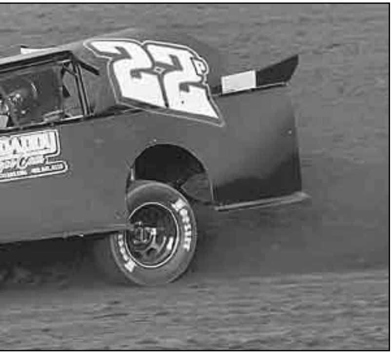
Saturday, August 11, 2018