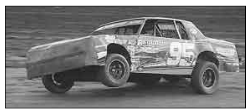
Tiffany Bittner (95B) runs three wheels through turns one and two during her heat race.