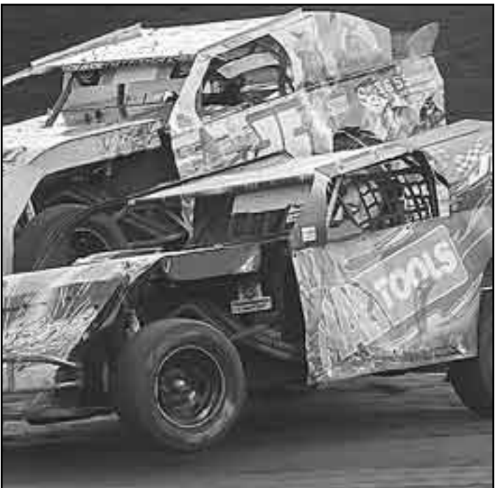
Cameron Meyer (21) and TJ Wallingford (25t) compete in their heat race. Wallingford later lead two laps in the feature before finishing eighth. Meyer took another top 5, finishing fourth.