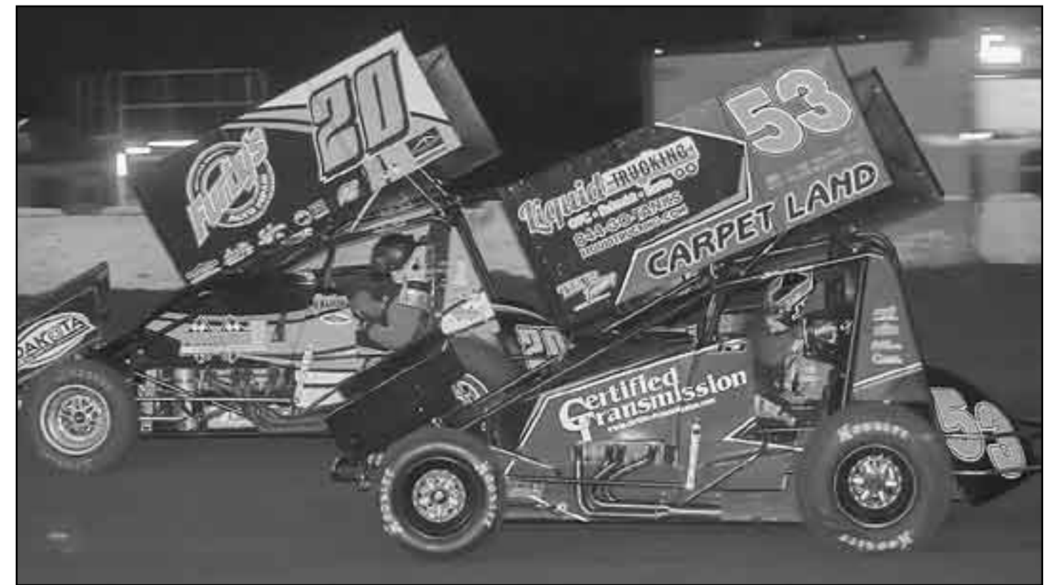
Jack Dover (53) runs the inside Brant O'Banion (20) during their heat race. Dover later won the main event.