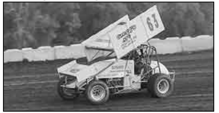
Gregg Schuetz (63) finished 14th in the feature.