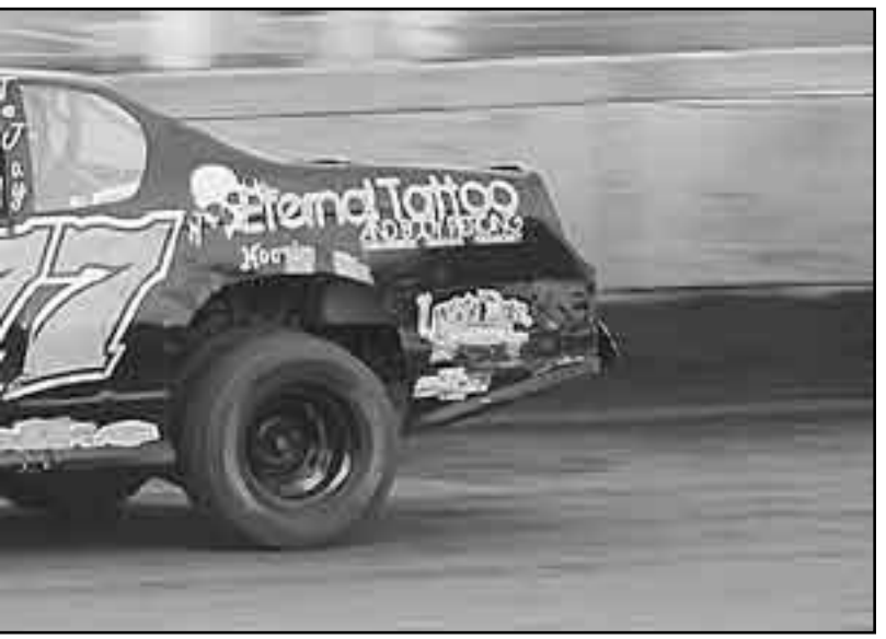
Saturday, August 25, 2018