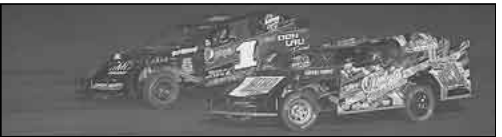
Wes Hochstein (21B) and Colby Langenberg (1J) work for position in the feature. Langenberg finished third in the feature.