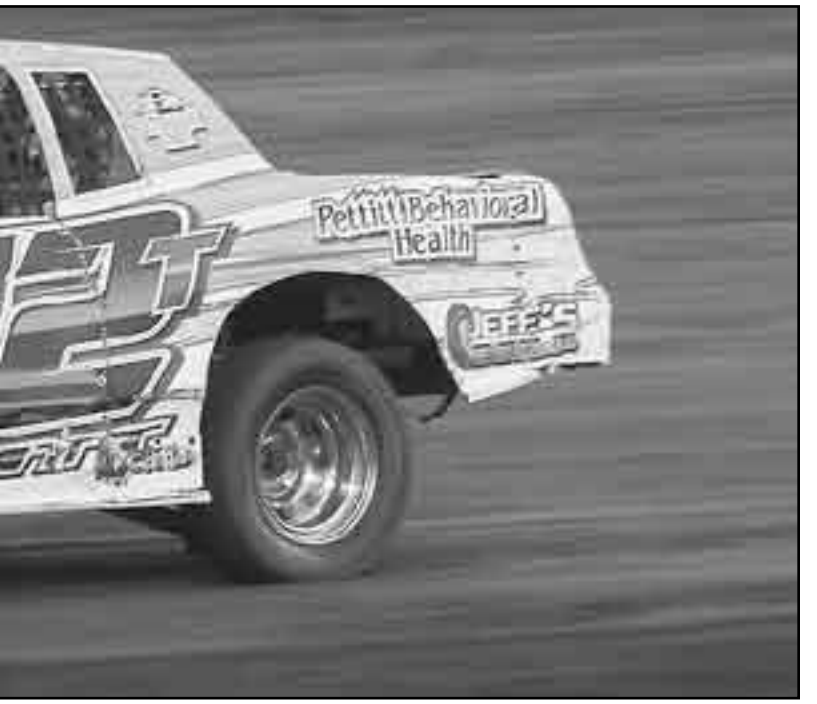
Saturday, September 1, 2018