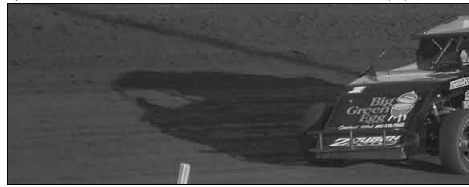
Colby Langenberg (1J) led all 20-laps to win his first feature at the track last week.