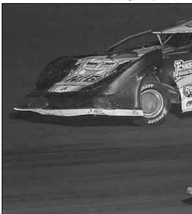
Chase Osborne (14) looks to pass Matt Haase (81) at the start