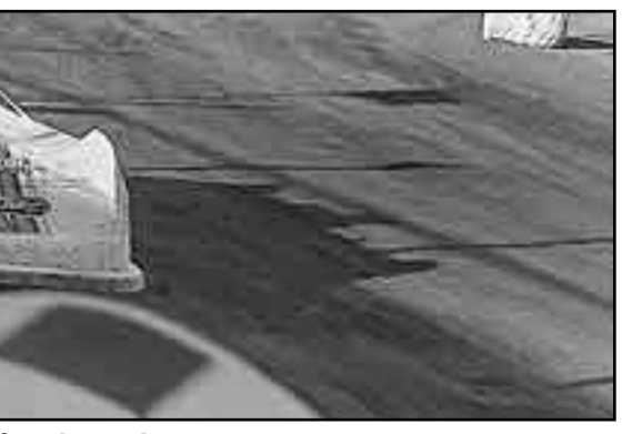
flag in their heat race.