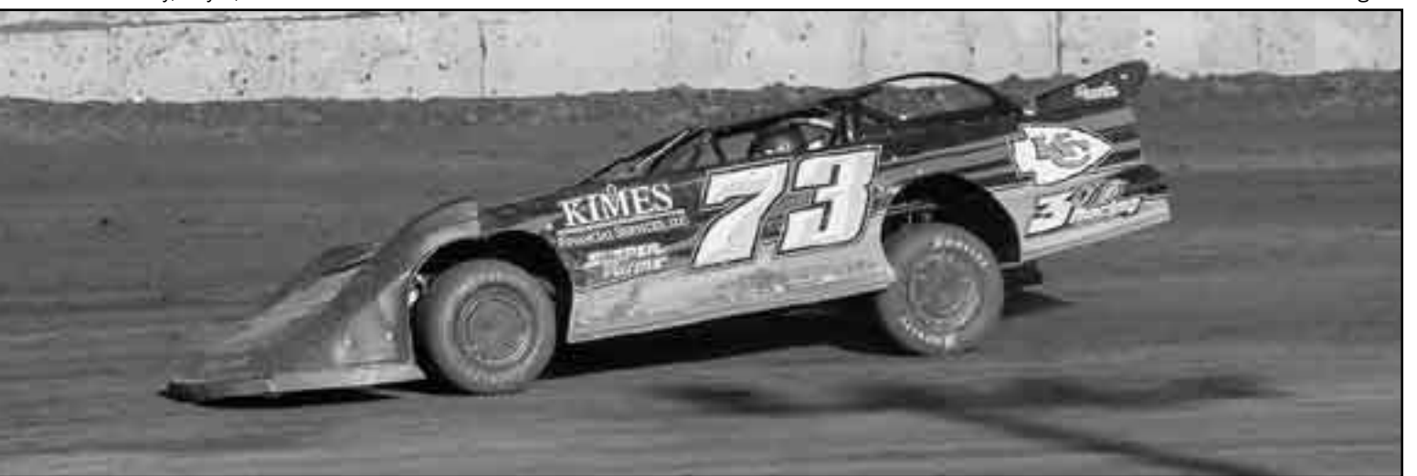
both his heat race and the feature. His first of the season and fourth at the track.