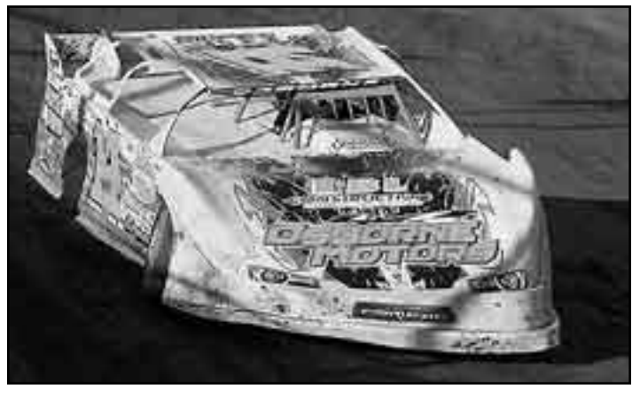
Chase Osborne picked up his fifth top 5 when he finished second in the feature.