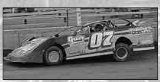
Late Model winner - Ben Sukup