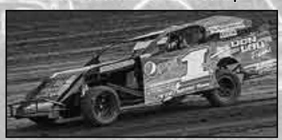
SportMod winner - Colby Langenberg