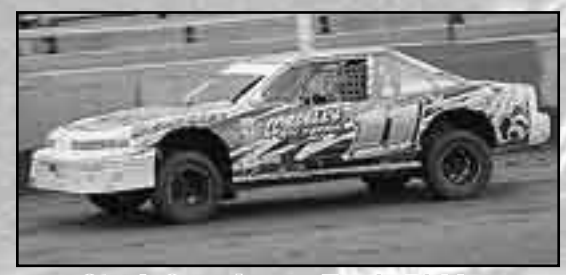
Stock Car winner - Travis Birkley