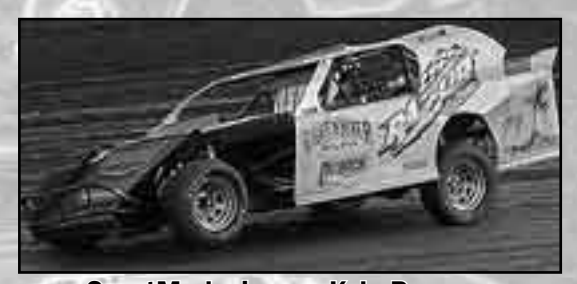
SportMod winner - Kyle Prauner