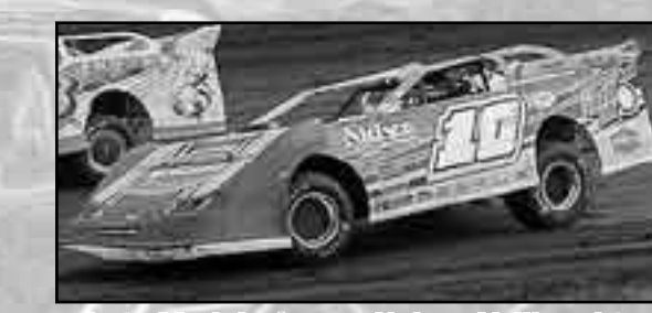
Late Model winner - Nelson Vollbrecht