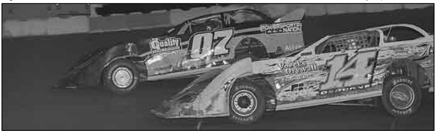
Ben Sukup (07) battles Chase Osborne (14) in the feature. Sukup won the feature, as Osborne took second.