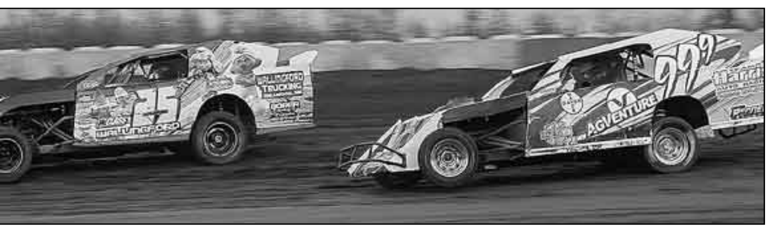
with TJ Wallingford in their heat race. Osantowski won the heat and later led eight laps in the feature to finish fifth.