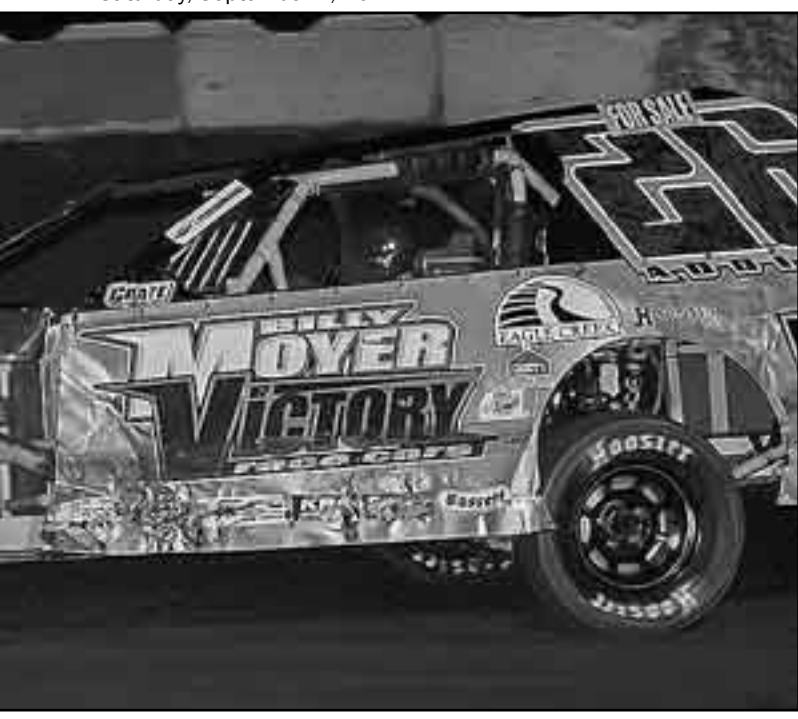
ading going into championship night.