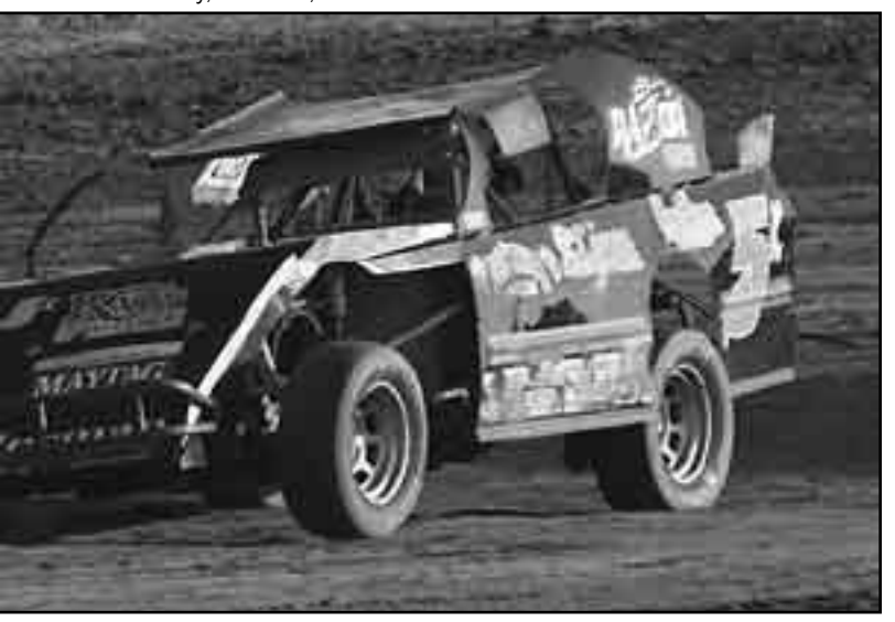
re to take his first career SportMod feature win.