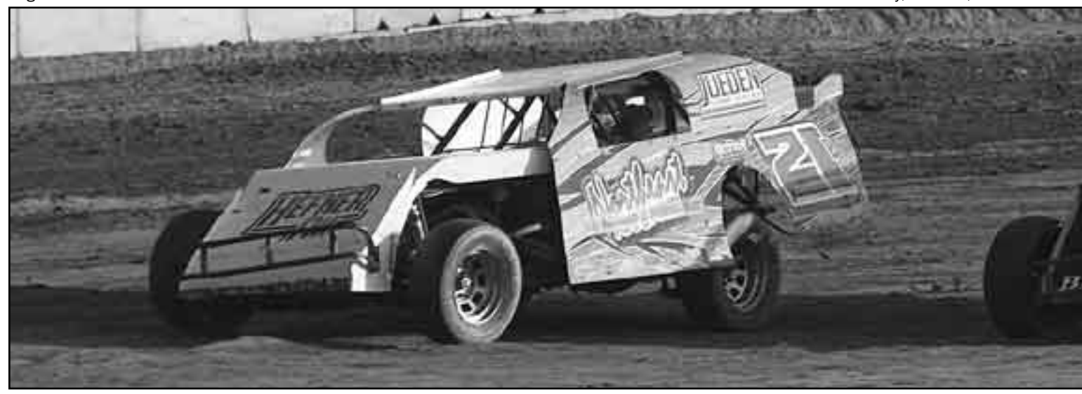
Wes Hochstein (21B) and Kyle Prauner (5K) race together in their heat race. Hochstein later held off Prauner in the feati