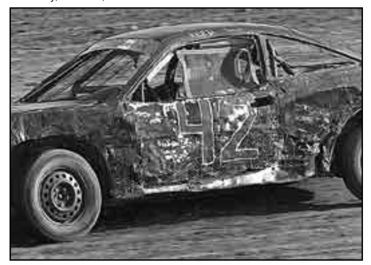
Kyle Reed (42) took a eighth place finish in the feature last week.