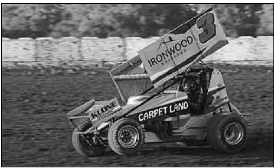
Billy Alley (3) finished third in the feature.