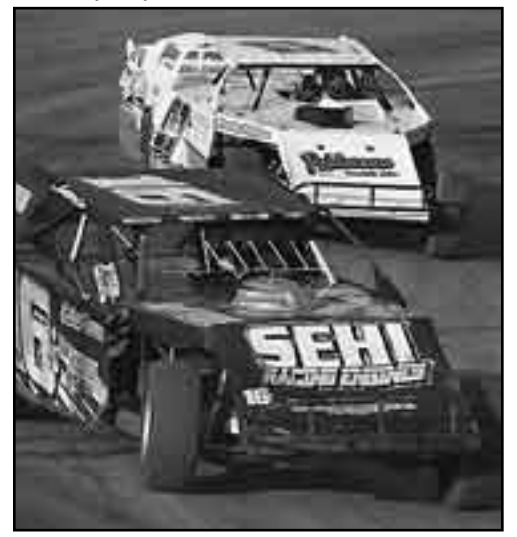
Derek Sehi (16s) exits turn four followed by Lukas Pohlman (07) in their heat race.