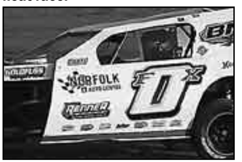
Derik Fox (0) took a sixth place finish in the feature.