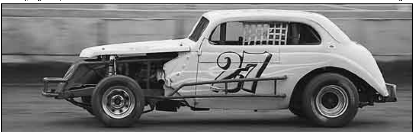
GOTRA driver Carrol Adamy (27) won the special feature last week.