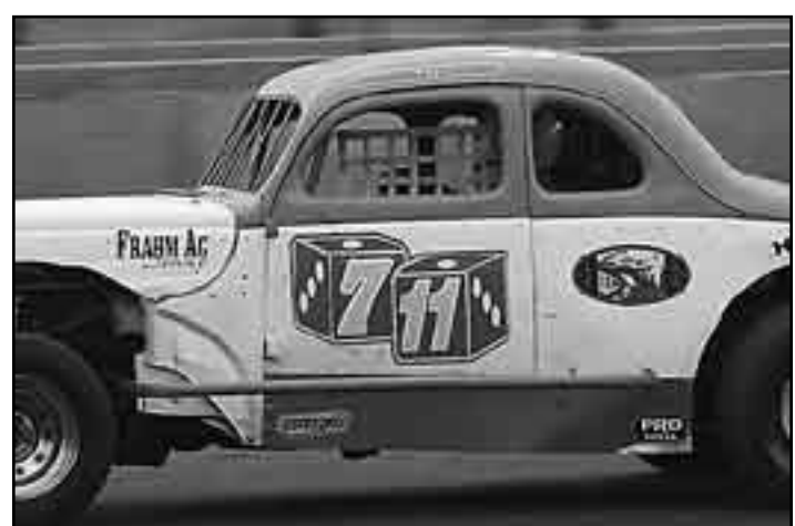
Darrell Doerr (7-11) took second in the feature.