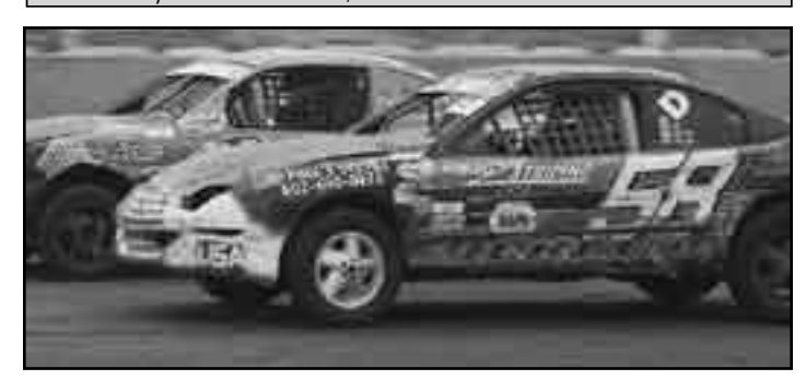
Tanner Uehling (58t) and Randy Nelson (18) race their heat race. Uehling led six laps in the feature and finished sixth.