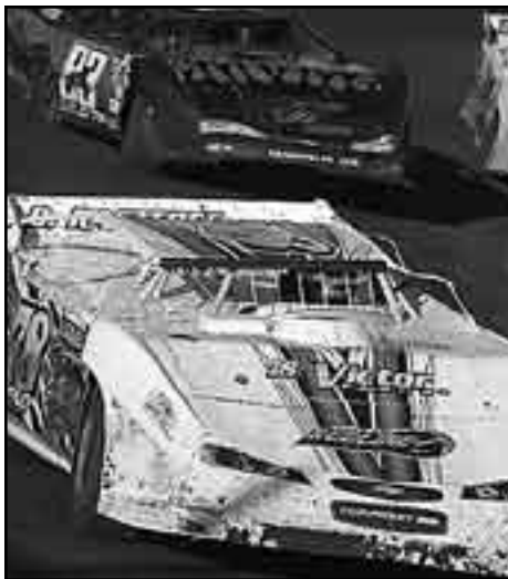
Travis Birkley (78) finished fourth in the feature.