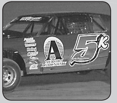
Stock Car winner Kyle Prauner