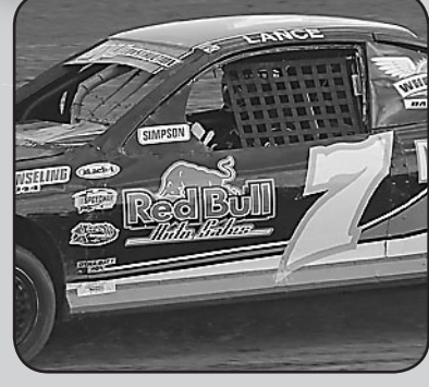
Sport Compact winner Lance Mielke