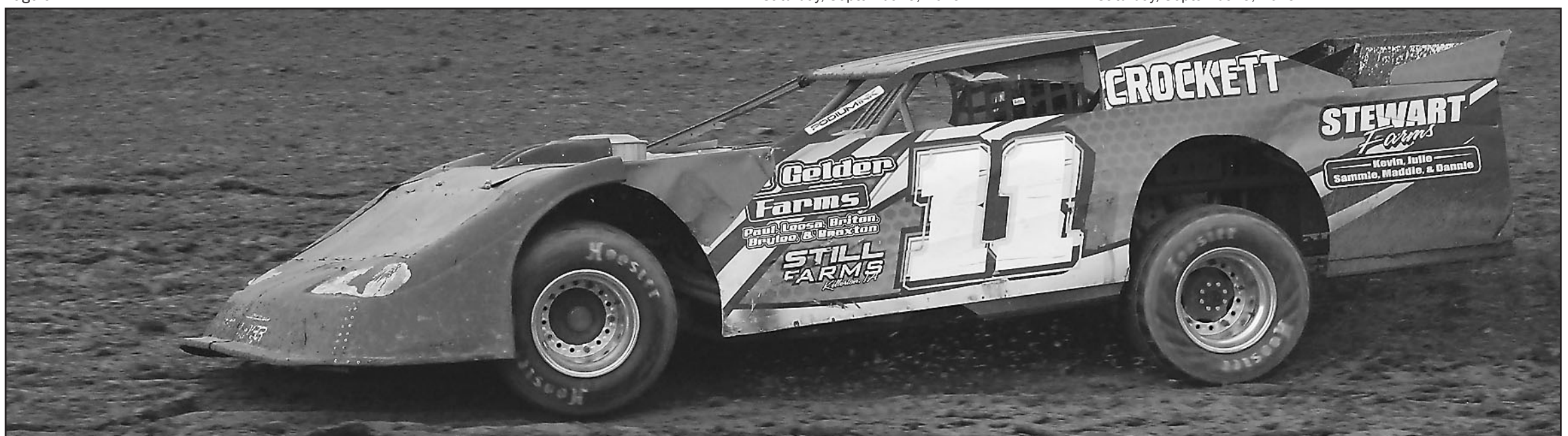
Brad Vogt (11) led 17 laps to win his first feature at the track last week.