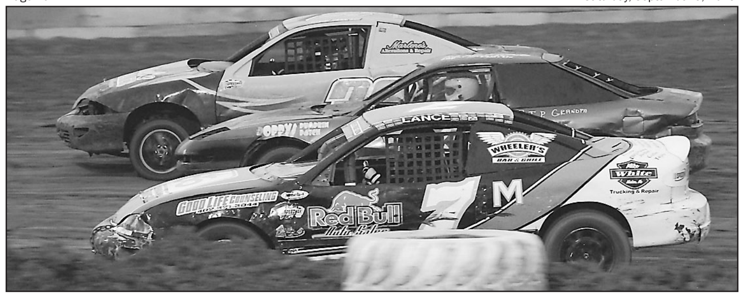
Lance Mielke (7m) goes three wide with Bo Cleveland (3x) and Colby Kaspar (39) during their heat race.

Saturday, September 5, 2015 Page 10 Saturday, September 5, 2015