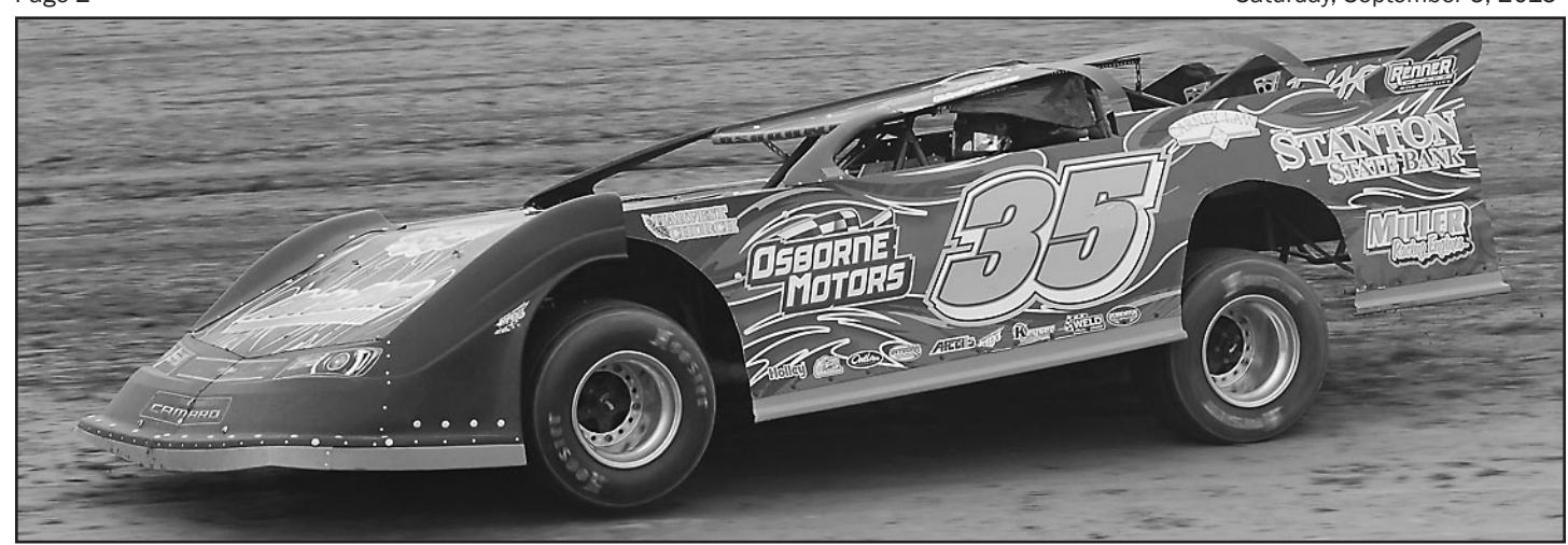
Robert Osborne (35) holds a four-point lead on Eric Vanosdall (9) going into tonight's championship race.

Page 2 Saturday, September 5, 2015 Saturday, September 5, 2015