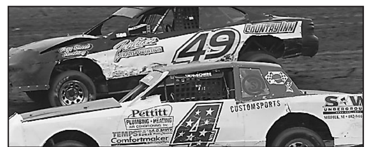
Dale Primrose (4) and Zach Zentner (49) race in their heat race.