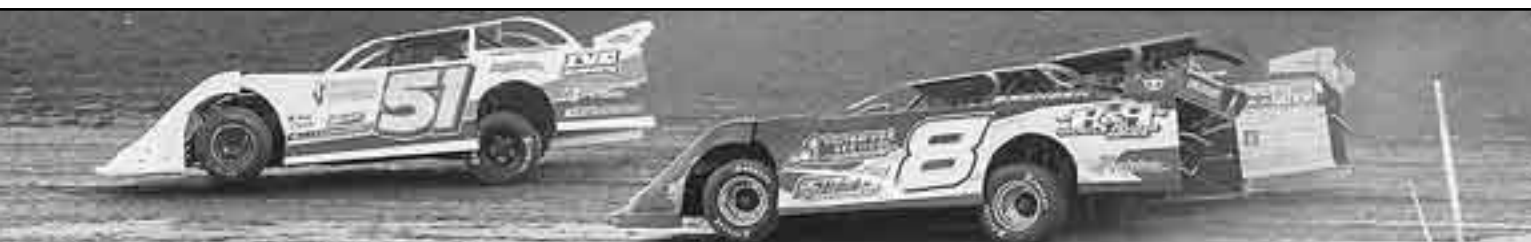
eyenhof (51) leads Lane Brenden (8) and kup (07) in their heat race. Beyenhof later l third in the feature.