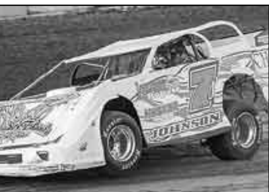
ohnson (7J) raced to a fourth place finish in n feature.