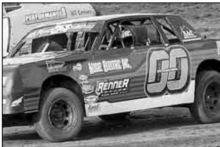
Shannon Pospisil (00) cross the line third in the feature.