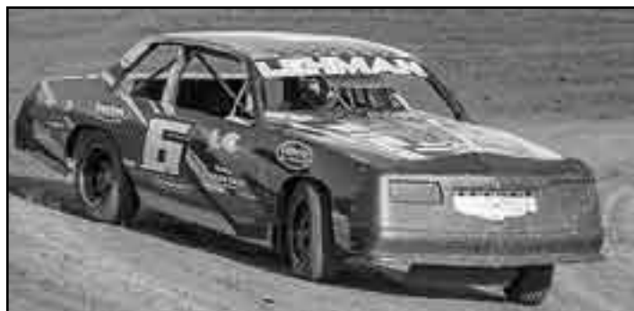
Wyatt Lehman (6) took fifth place in the feature.

Nic Kimmel of Norfolk crossed the line fourth as Wyatt Lehman rounded out the top 5.