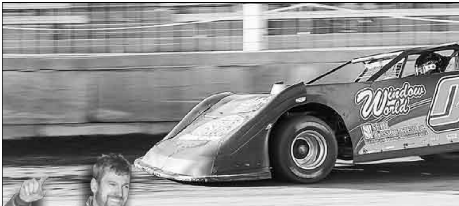
Tad Pospisil (04) led all 30 laps to win the Tri-State Late Models main feature.