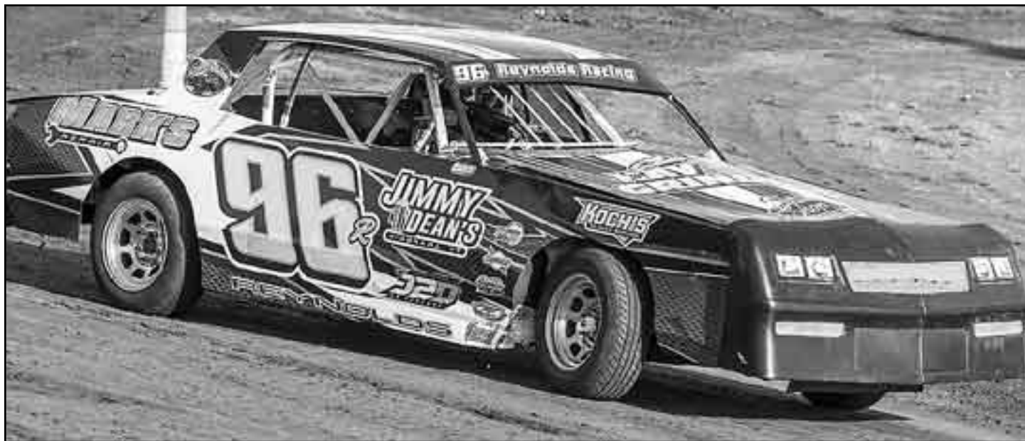
Stephanie Reynolds (96R) led four laps before finishing second in the feature.