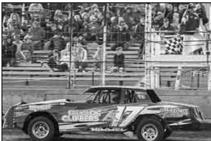
Nic Kimmel (k17) captured his first top 5, finishing fourth in the feature.