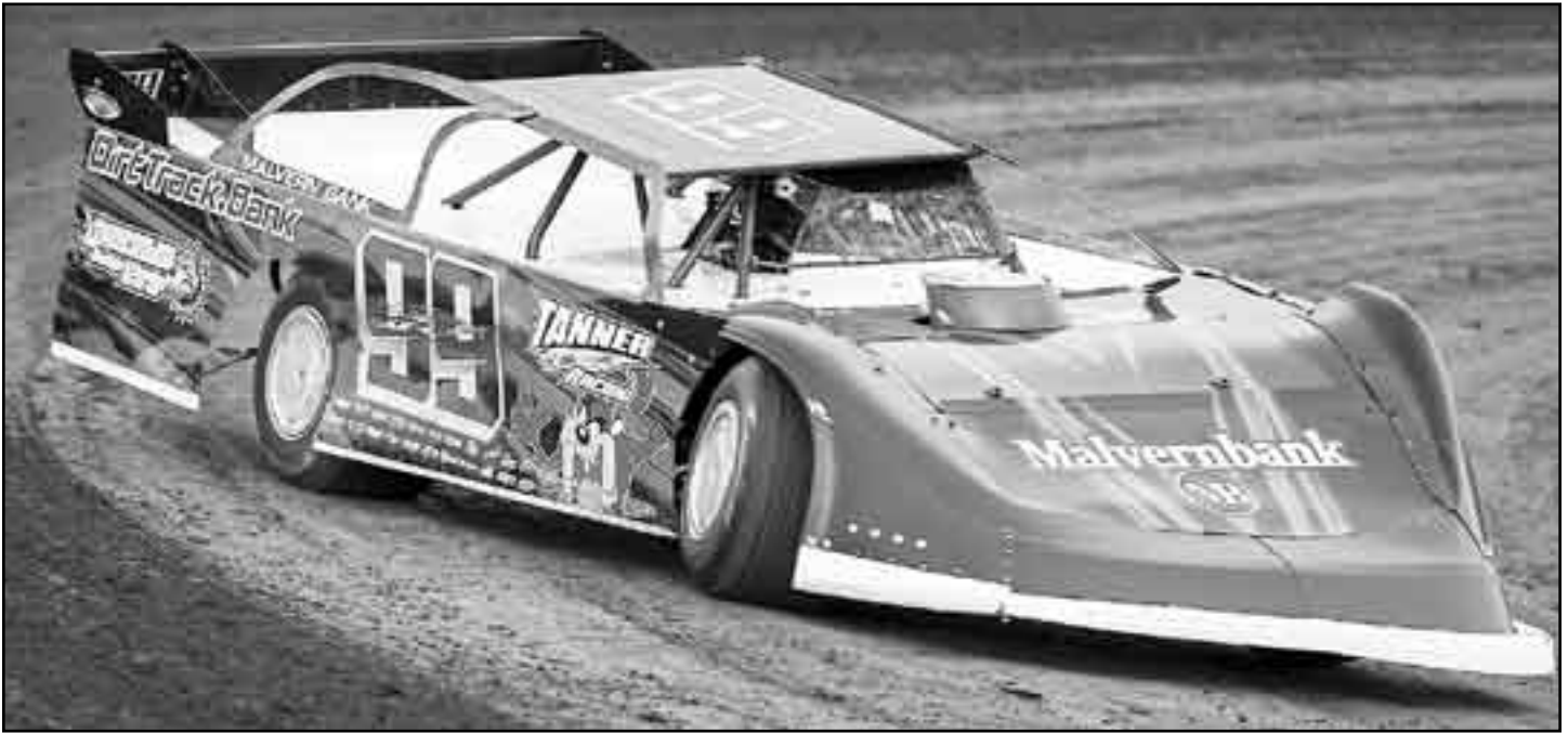
Jesse Sobbing (99) took home the feature victory in the Super Late Model Racing.