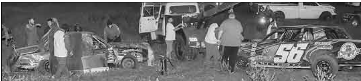
Crews work to remove Nate Buck (56) and Shaughn Hendrix (11H) who went up and over the backstretch wall.