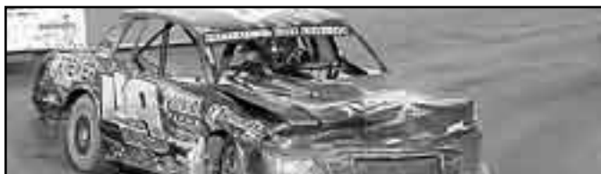
Ryan Harris (49) picked up another top 5 finishing fourth in the feature.