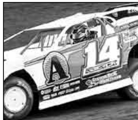
Kyle Berck (14) took a third place finish in the feature.