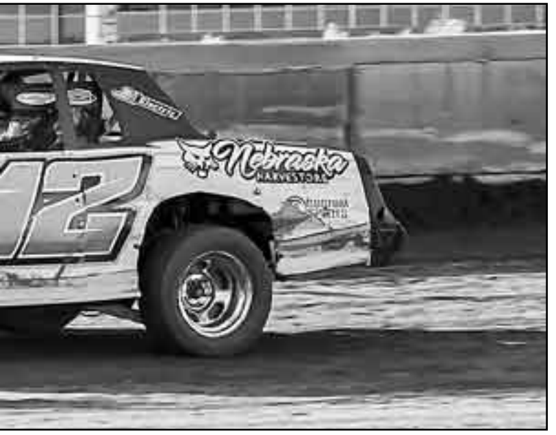
pt. 1, 2018.