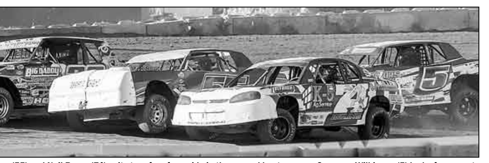
nm (55) and Neil Bruns (74) exits turn four four wide in the second heat race, as Cameron Wilkinson (5) looks for a way to