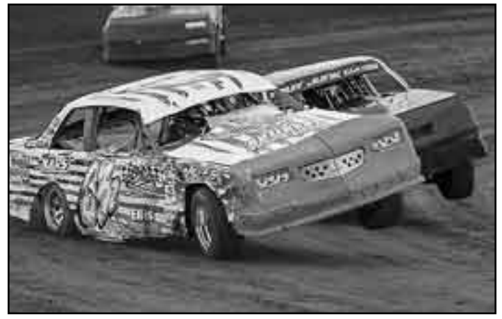
Allen Zimmerman (83z) pulls out of turn four