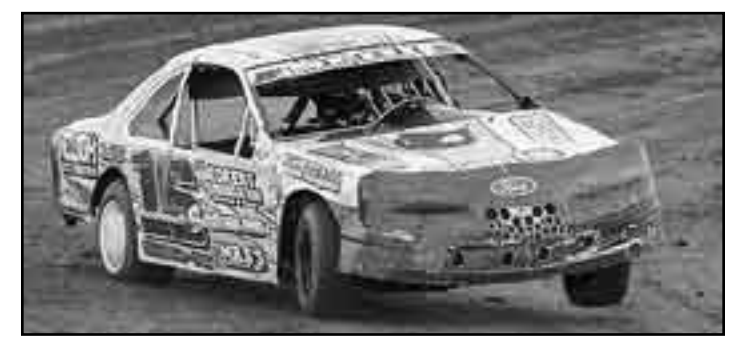
Derek Sehi (16s) finished fourth in the feature.