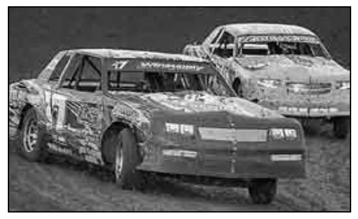
Nic Kimmel (K17) had his fifth top 5 placing fourth in the feature.