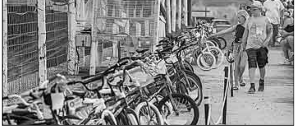
Nearly 50 bikes were donated by drivers and others during the bike giveaway last week.