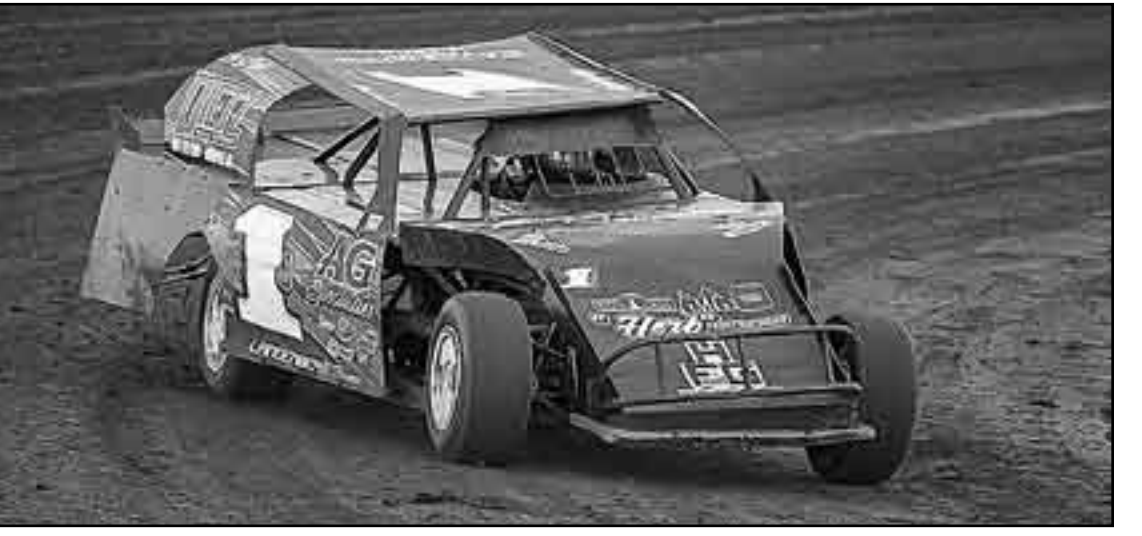
Colby Langenberg (11) finished second after leading 14 laps in the feature.

Jeremy Gnat of Battle rounded out the top 5 for sixth top 5.