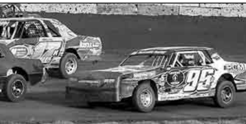
later finished third in the feature.