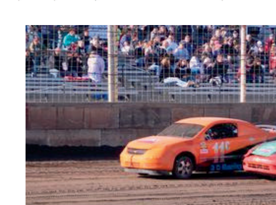
4 Cylinder Heat